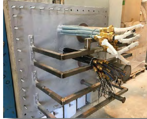
Example of mock ups realised as part of qualification works